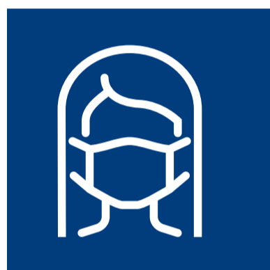
FFP2-Maske wenn man sich bewegt / geht FFP2-mask when walking / moving around