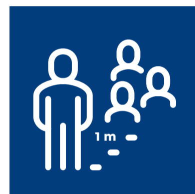
Unterrichtssituation Teaching situations