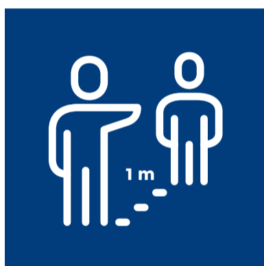
1 m Abstand 1 m distance

3G geimpft / vaccinated getestet / tested genesen / recovered