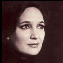
KS Edda Moser