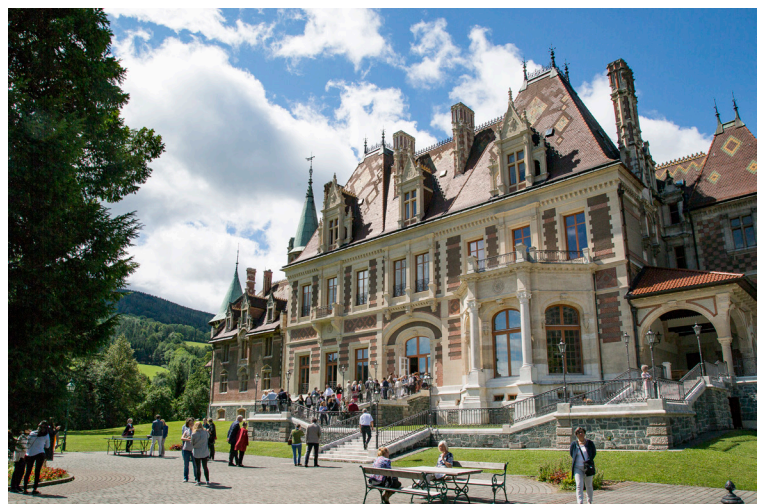
Schloss Rothschild